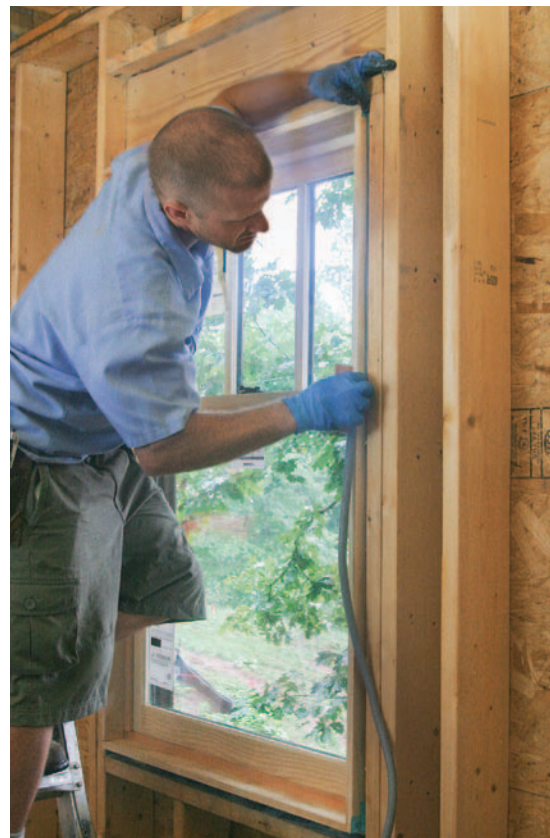
A caulk joint that will last. Foam backer rod cut and pressed in around the window jamb creates a flexible base for the bead of caulk that follows it. Use a wet finger to smooth the bead against the backer rod, creating the ideal hour-glass shape that allows the sealant to expand and contract without cracking or debonding.