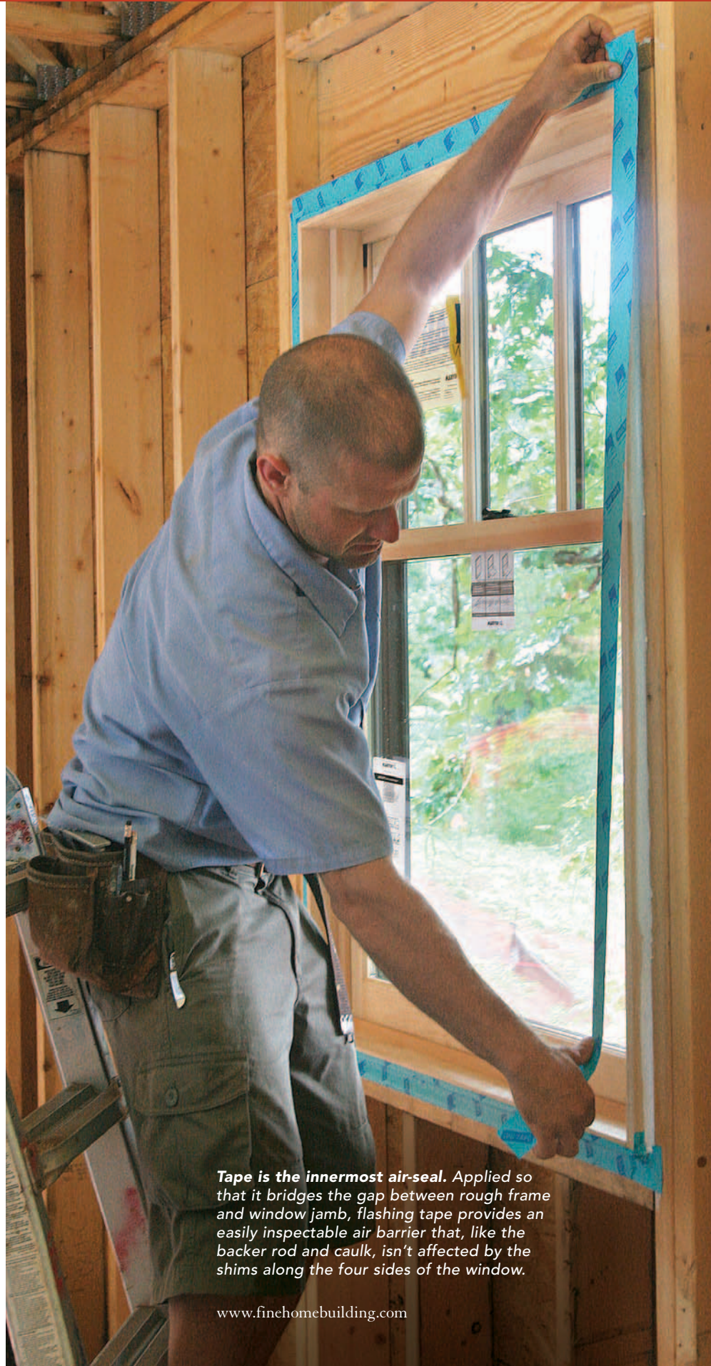
Tape is the innermost air-seal. Applied so that it bridges the gap between rough frame and window jamb, flashing tape provides an easily inspectable air barrier that, like the backer rod and caulk, isn’t affected by the shims along the four sides of the window.