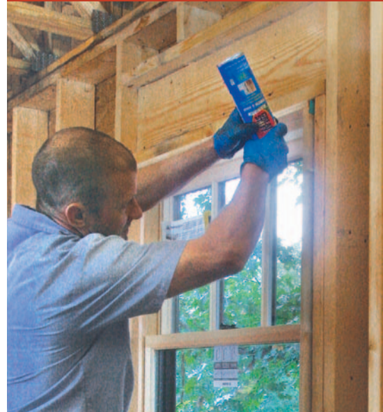
A conservative bead of foam. A thin bead of low-expansion spray foam offers limited air-sealing and insulation, but avoid filling the entire cavity, especially toward the bottom, to allow for drainage in the case of water entry.